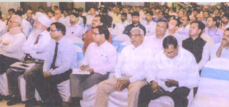
▲ A cross section of the participants of the Customer Meet at Raipur.

During the month of October 2017, BCSBI organized two customer awareness meetings in association with TransUnion CIBIL Ltd. viz. (i) at Indore on October 3, 2017 when around 300 customers and bank officials from major banks situated in the region attended; and (ii) at Raipur on October 9, 2017 when around 300 customers and bank officials from major banks situated in the region participated.